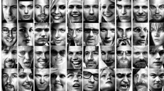
Figure 2: Some example images from the aligned PubFig83 database with various real-world changes on facial expression, pose, illumination, occlusion, resolution, etc.

We present our recognition results on Table 7. Chiachia et al. (33) and Chen et al. (27) achieved 92.28% and 90.14% recognition rates, respectively. Chen et al. used the discriminative features learned from the supervised deep neural network. Our system outperforms and achieves 95.87% rate. This comparison also shows that each region and each model contribute unique and discriminative features.